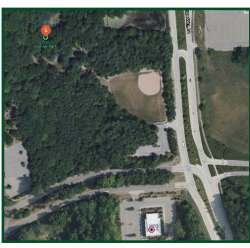
1827 N Squirrel Rd, Auburn Hills, MI 48326

Enter Cross Creek Parkway on the west side of Squirrel south of University Drive